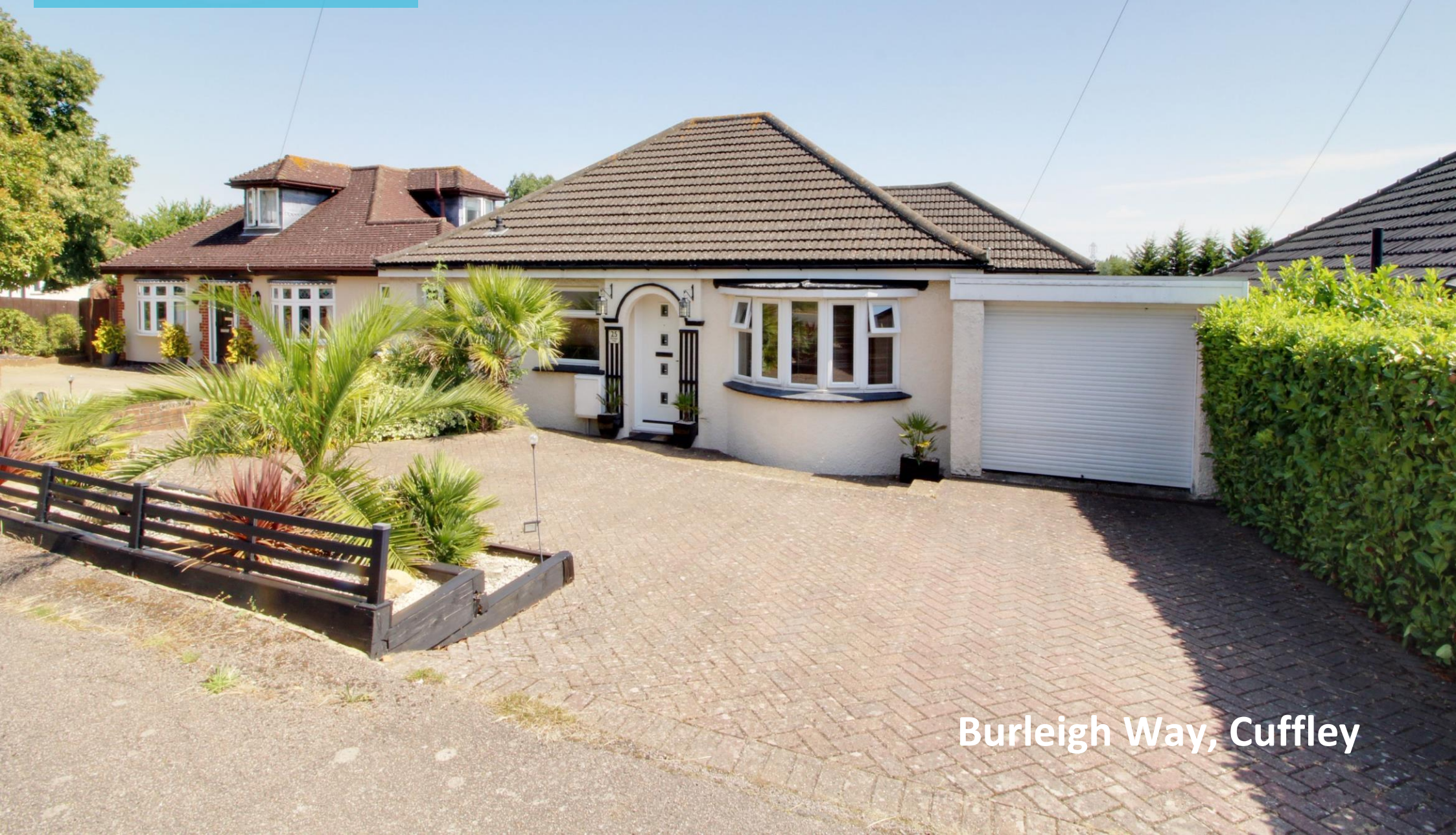
Burleigh Way, Cuffley